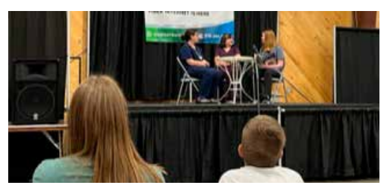
Our High School Drama Camp went on the road with a performance at the Montrose County Fairgrounds.