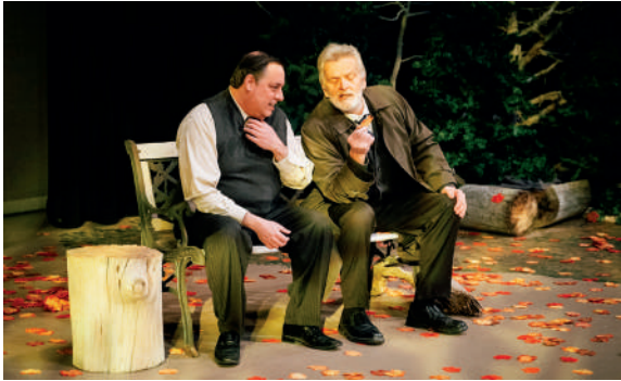
It's a WRAP! My Funny Valentine on the Silver Screen