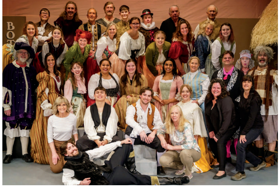
It's a WRAP! Something Rotten