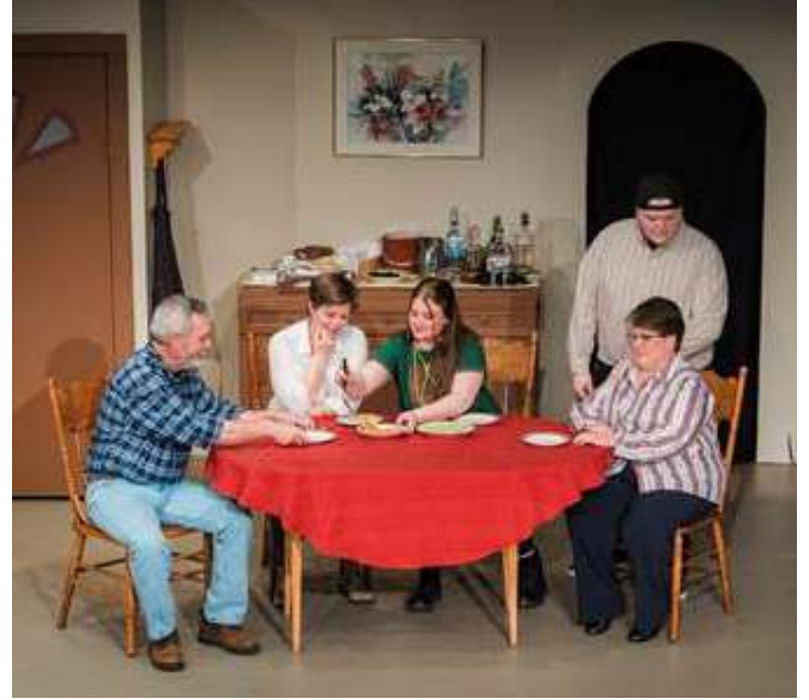
It's a WRAP! The Tin Woman